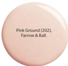
Pink Ground (202), Farrow & Ball.

LEFT: From top: Kalos Emb GWF-3301 in Pink/Sage by Groundworks, Lee Jofa; Kohana in Camellia, Roma.