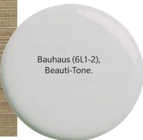
Bauhaus (6L1-2), Beauti-Tone.