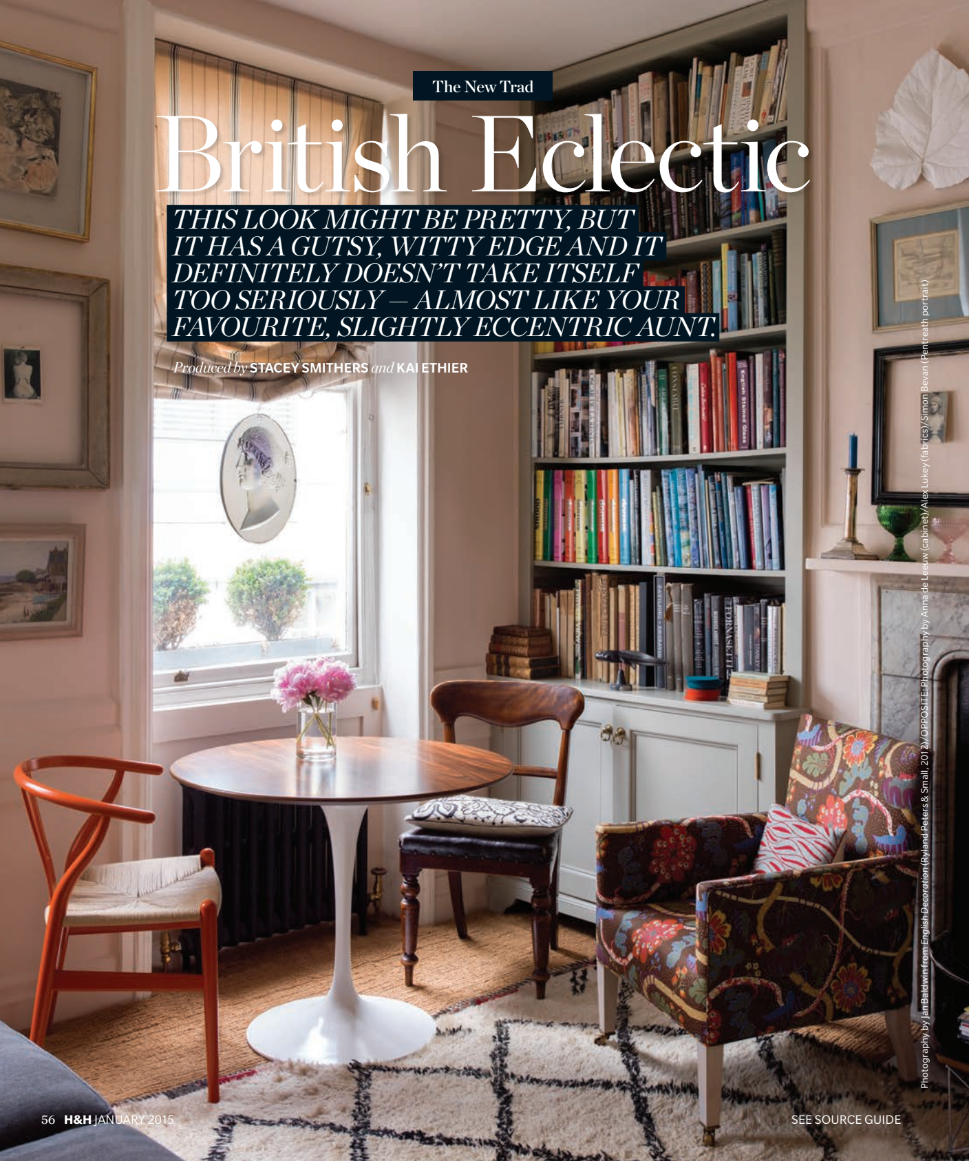
OPPOSITE