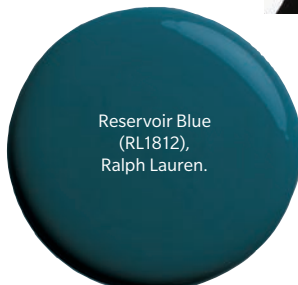
Reservoir Blue (RL1812), Ralph Lauren.

1. Abstract sculptures bring polish to tabletops. Small Mobius sculpture by Oly Studio. $480. At South Hill Home. 2. A silk rug with an understated pattern adds a hint of visual interest. Illusion Kebriti rug. $3,950 (6' x 8'). At Weavers Art. 3. This leggy desk has a surprising touch: a velvet lining. Reveal desk by Keno Bros. $4,880. At Elte. 4. Oversized graphic artwork energizes a refined space. Black & White Abstract Painting 2 by Natural Curiosities. From approx. $1,472 (unframed). At Elte and Celadon. 5. A mod matte black sconce with contrasting metallic interior heightens the drama. Grace sconce. $4,450. At Avenue Road.