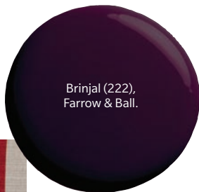
Brinjal (222), Farrow & Ball.