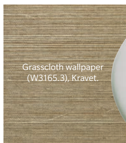
Grasscloth wallpaper (W3165.3), Kravet.